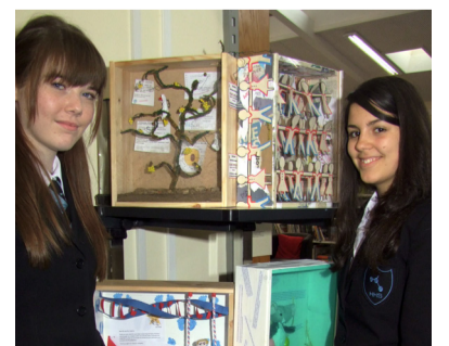
Pupils with work on display

This is the second year this successful scheme was run in collaboration with the Norwich BioScience Institutes. "Science & Art in a Box" is one of the many community events created and organised as part of an established 'Educational Events' programme at Hethersett High School & Science College. ■